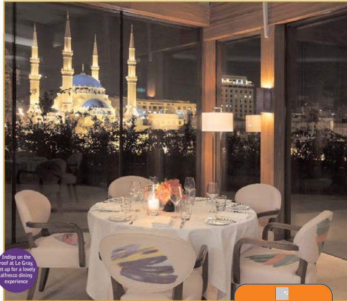
Indigo on the roof at Le Gray, set up for a lovely alfresco dining experience