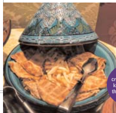
Beef and cracked wheat kibbeh (left); the ubiquitous hummus

Armenian food; no English spoken; Alfred Nobel Street