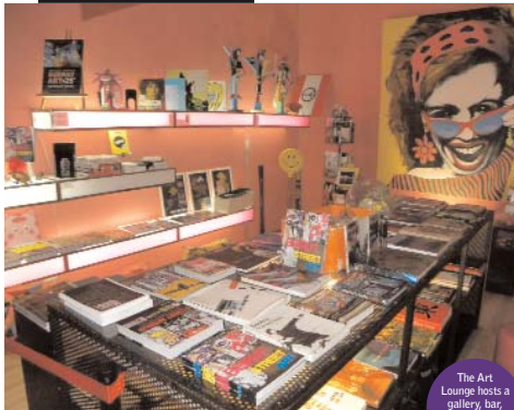
The Art Lounge hosts a gallery, bar, bookstore, concert hall and art store